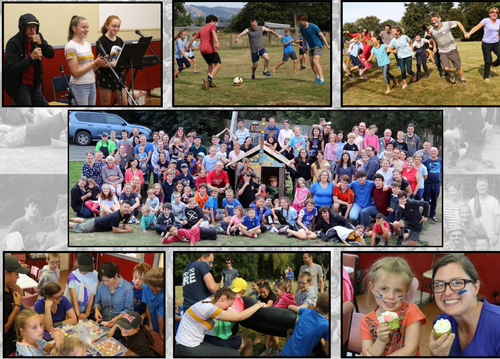
Leith Valley Church welcomes and includes Children and Youth