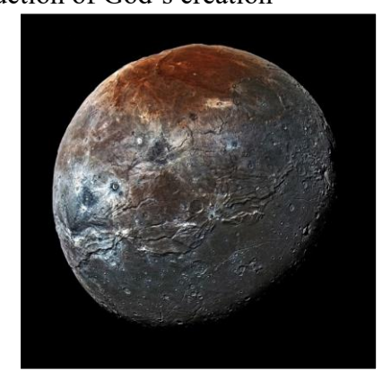
Destruction of God's creation