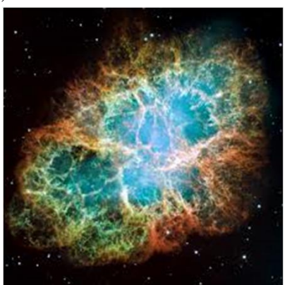
Chaotic, broken universe: